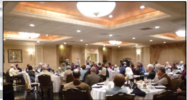
A luncheon on Friday offered missionaries a chance to interact with members of the Great Commission Committee and church staff.