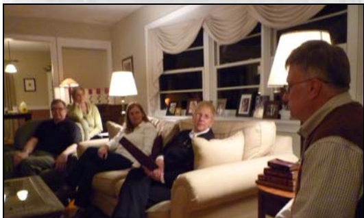
Home Fellowships hosted missionaries throughout the week.