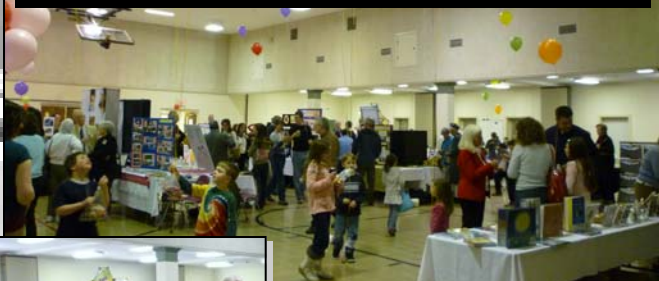
While no exact numbers are available, MissionFare on Saturday drew what's probably a record crowd.