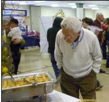
“I wonder what this is?”