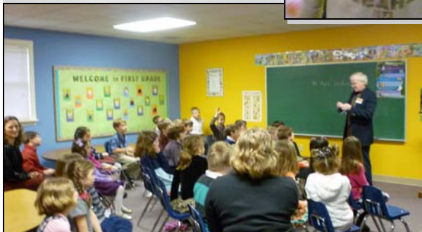
Each Sunday School class heard reports from two missionaries.