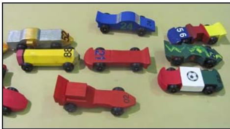
Above: All cars weigh the exact same but the designs are widely varied.